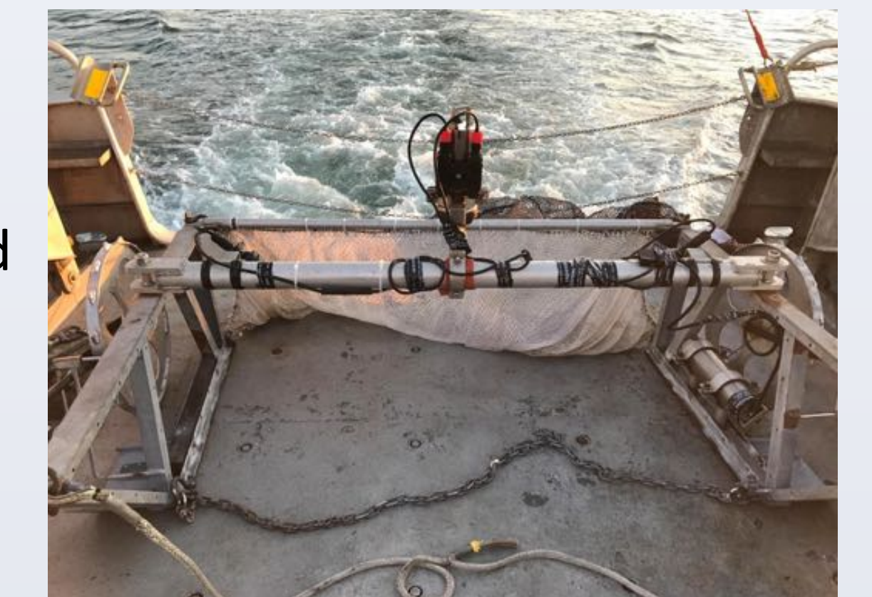
Figure 4. Two meter wide beam trawl used in NH line study.